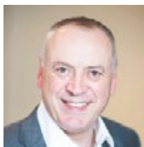
Karl Elliott Clague Architects